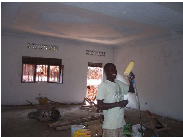
Painting the inside of new staff housing.