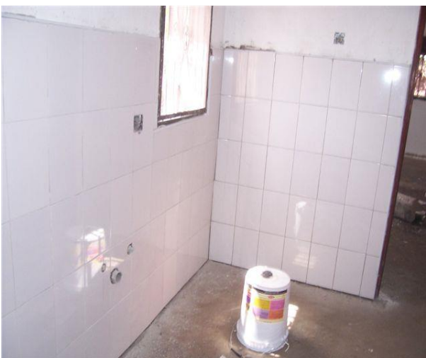
Tiling on the bathroom walls