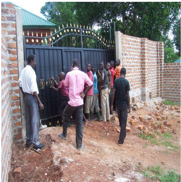
The security gate at the clinic being installed

Every bit we get adds up. Your donation will bear fruit for years to come as hundreds of children sit in this classroom and learn their way out of poverty.