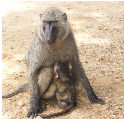
Mama and baby baboon