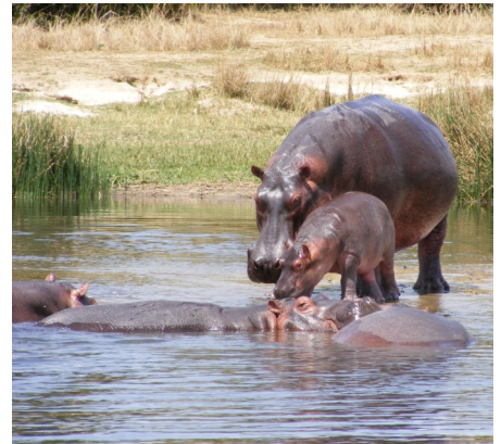
Mama and baby hippo