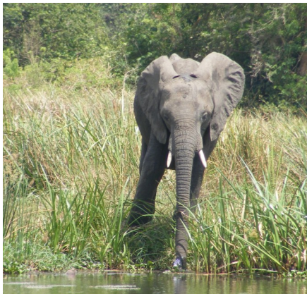
Elephant drinking from the Nile

3 days were spent at Murchison Falls National Park. This was our first Safari and after going to Uganda so many times, it was great to see the wildlife. The boat ride on the Nile River was the highlight of the trip.